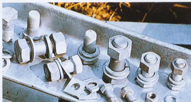
Fig. 2: The hot dip galvanizing of mechanical fasteners, e.g. nuts and bolts, falls within the scope of this standard.