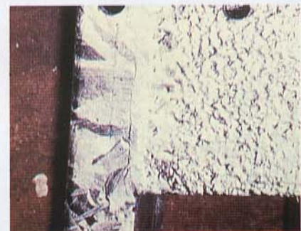
6. Old and new steel welded together and then galvanized. The corrosion pits are still visible.

The standard points out that the responsibility for changes in the mechanical properties of the component due to galvanizing, resides