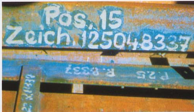
Fig. 5: Paint markings showing through the galvanized coating.

The introduction also points out that the surfaces to be galvanized should be free from contamination (paint, oil, grease, welding slag for example) that will not be removed by the